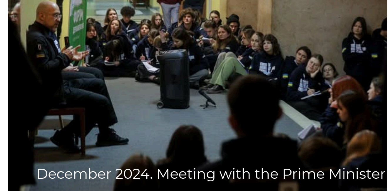
December 2024. Meeting with the Prime Minister