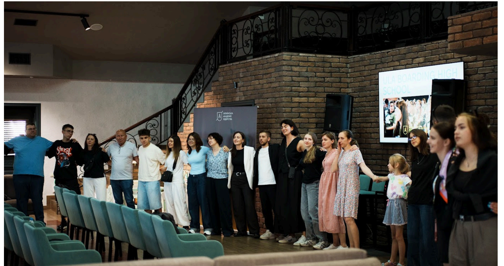
Photo: Singing “Ukraine” in a circle at the program opening. August 2025