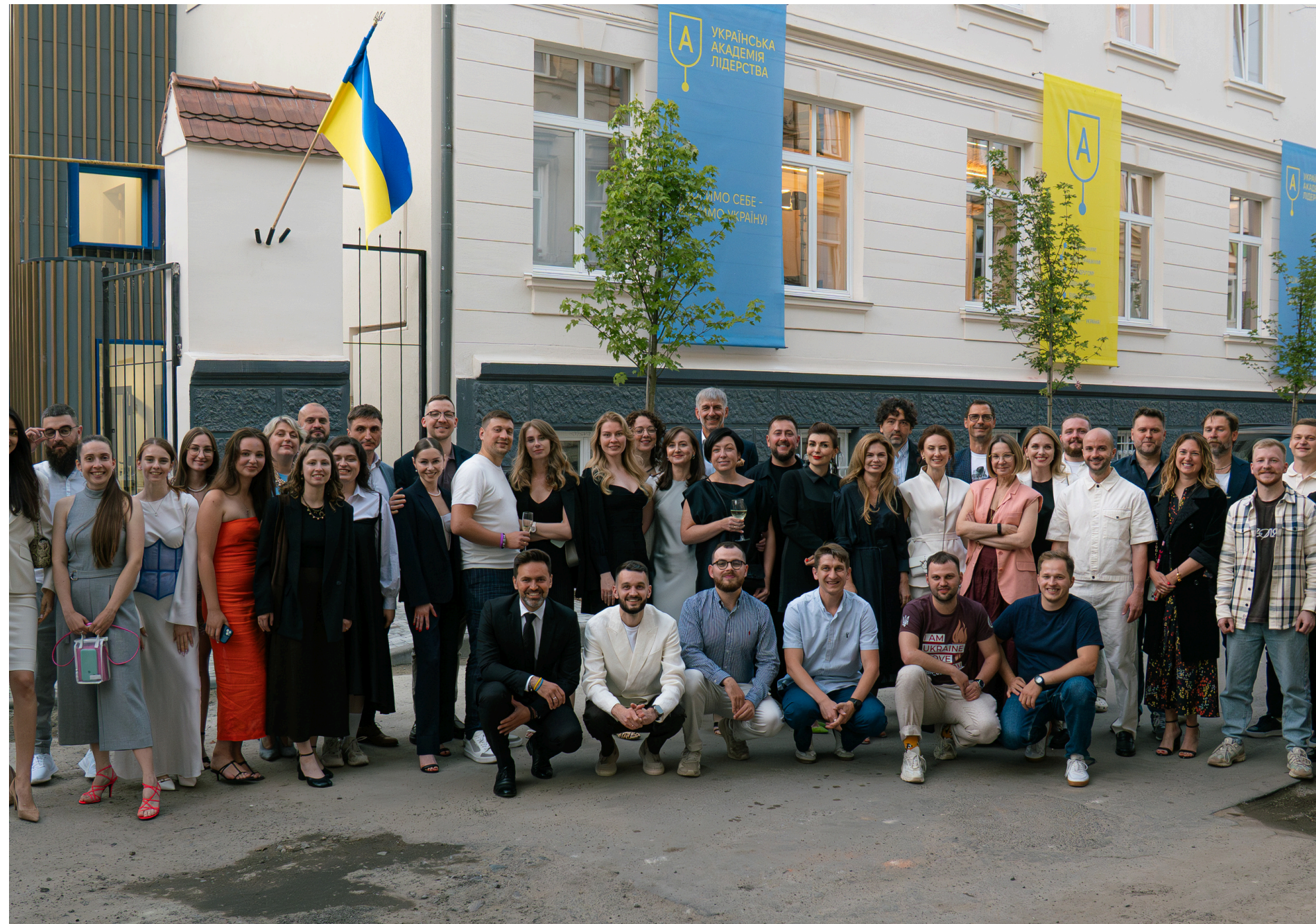
Photo: Group photo with Charity Event participants near the Ukrainian Leadership Academy campus. June 2025

Over 11 months of the program, 100% scholarships were raised.