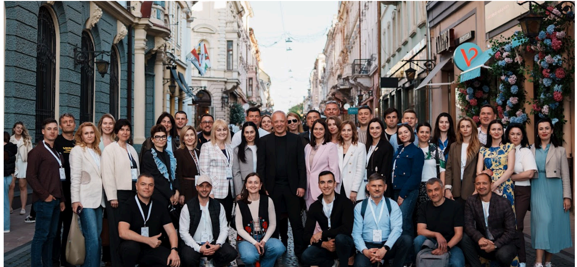
Photo: Third program module with the Mayor of Chernivtsi, Roman Klichuk. May 2025

The program became a platform for strengthening cooperation and joint development with the Academy's key partners.