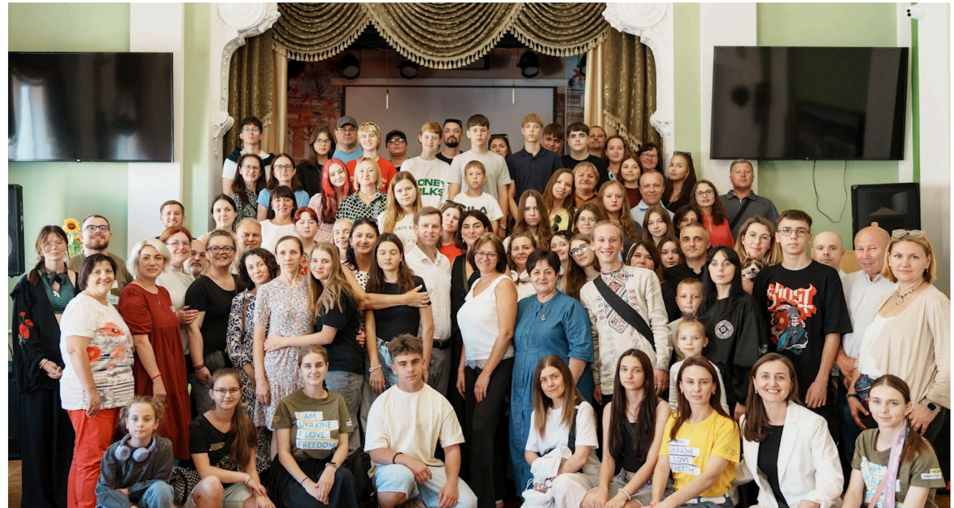
Parents, program participants, teachers, and the Academy team at the Ternopil Academic Lyceum “Ukrainian Gymnasium” named after Ivan Franko. August 29, 2025

Currently, 33 tenth-grade students from different parts of Ukraine are already enrolled, combining the lyceum’s academic education with the Academy’s Formation Program.